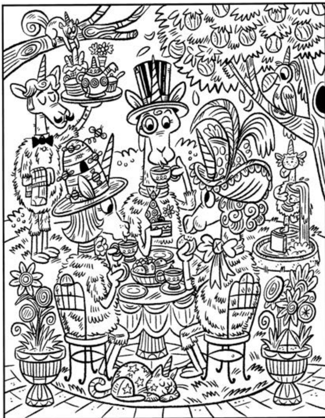
Art by Luke Flowers