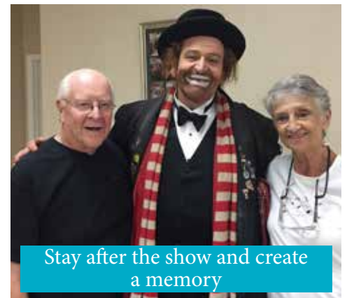
Stay after the show and create a memory

DOORS FOR 7 PM EVENTS OPEN AT 6:30 — NO PRIOR ADMITANCE