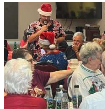
Emoji Game Results