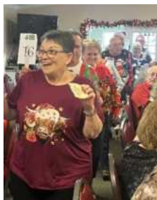
Ugly Sweater Contest