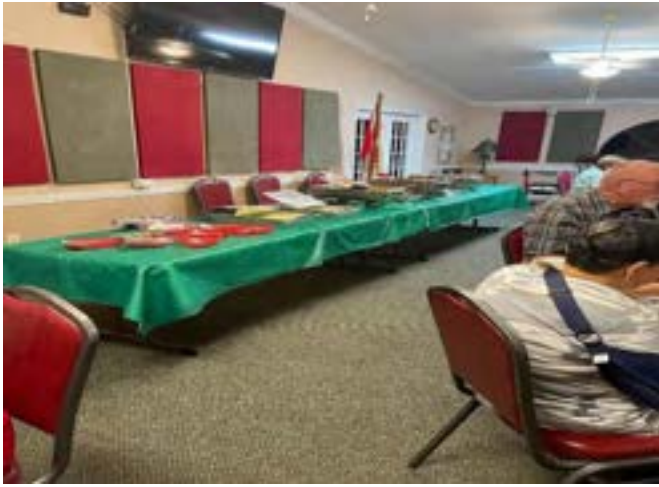
Food Catered by Sony's BBQ