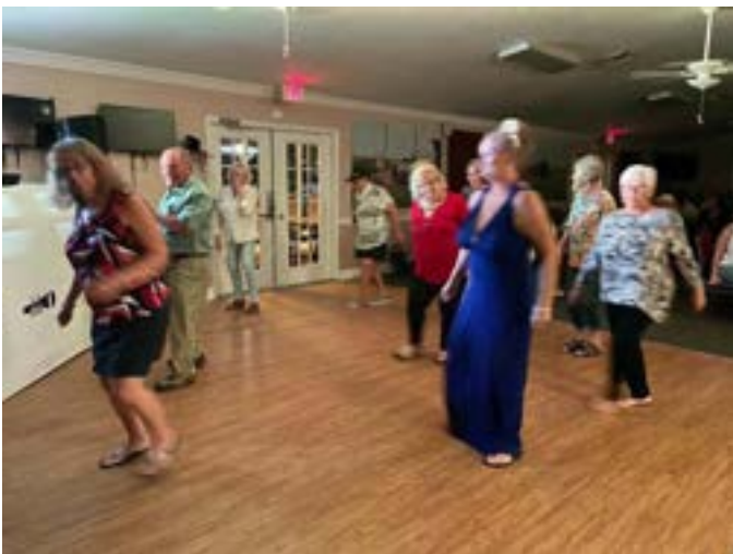
Line Dancing done easy