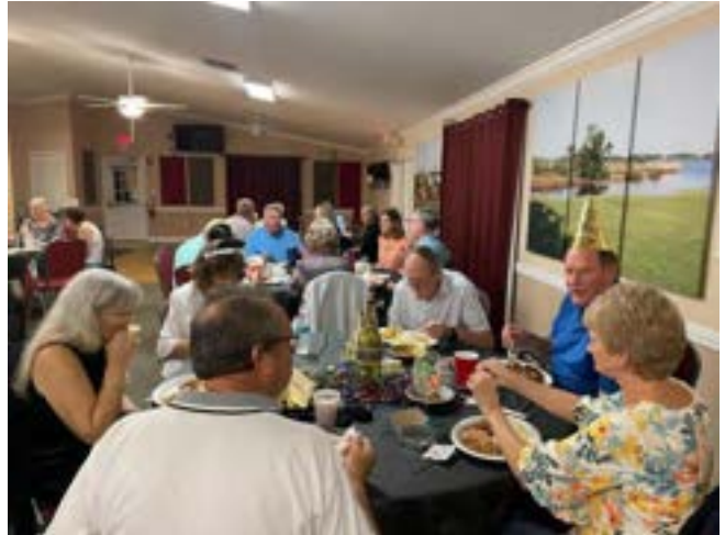
Macarena Dancing Flamingo