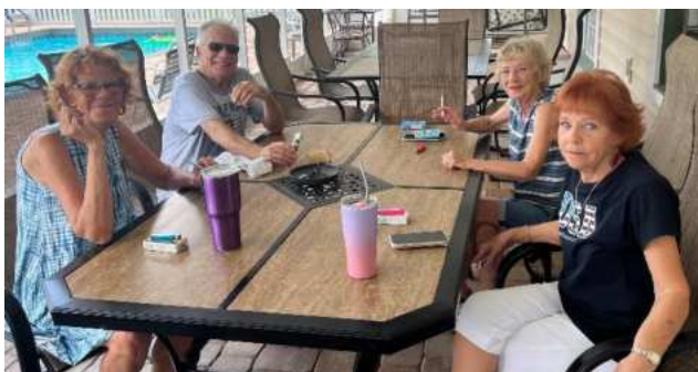
Staff resting after putting on a great party!